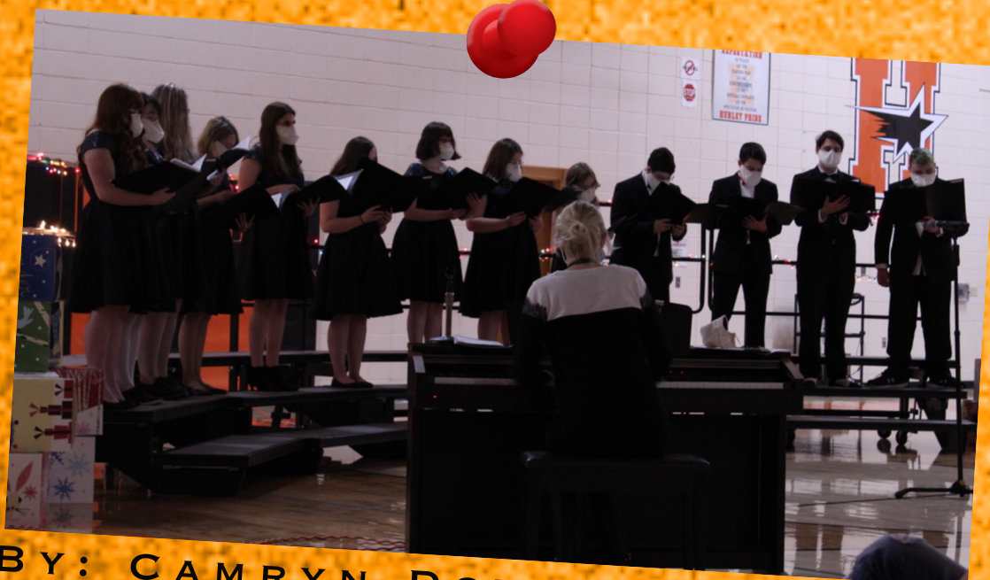
BY: CAMRYN DOWD