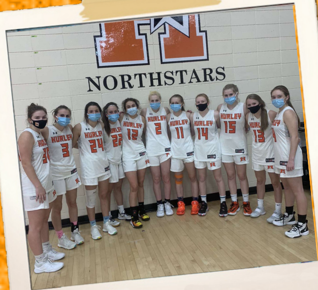
BY: JULIA SOKOL