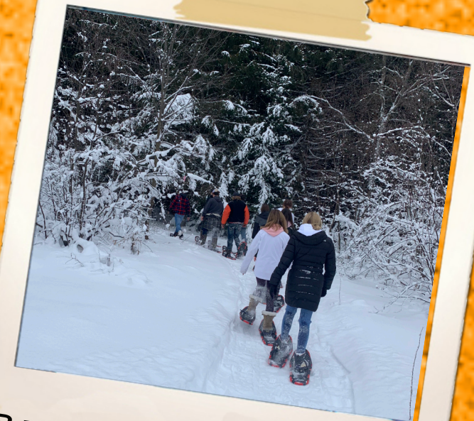
BY: COREY CHILSON