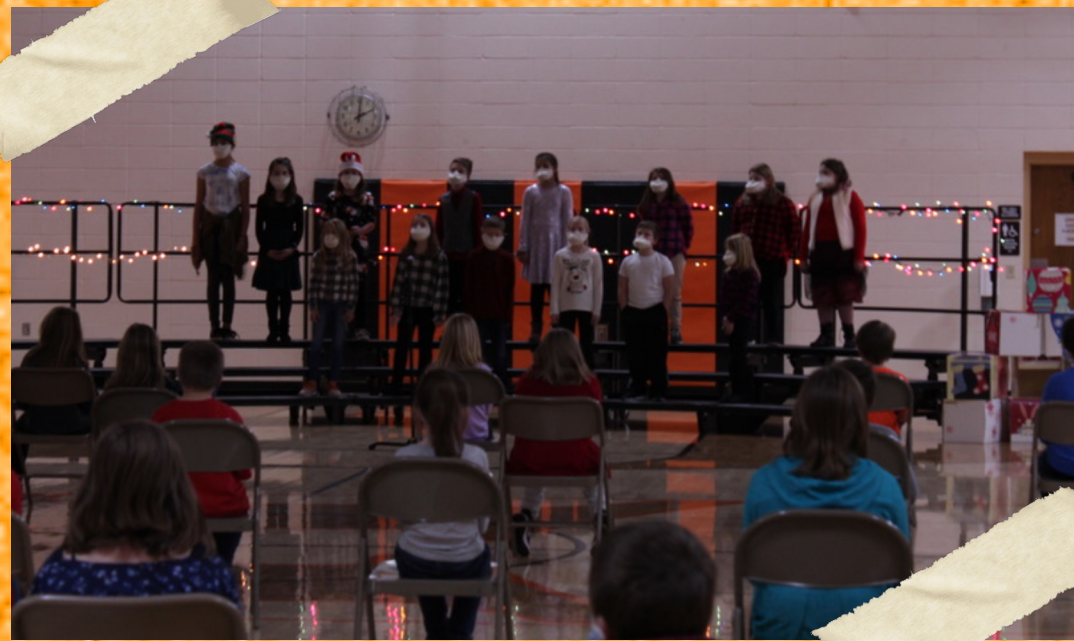
BY: CAMRYN DOWD